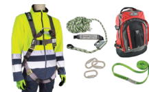
HD Roofers Kit ZRK03H