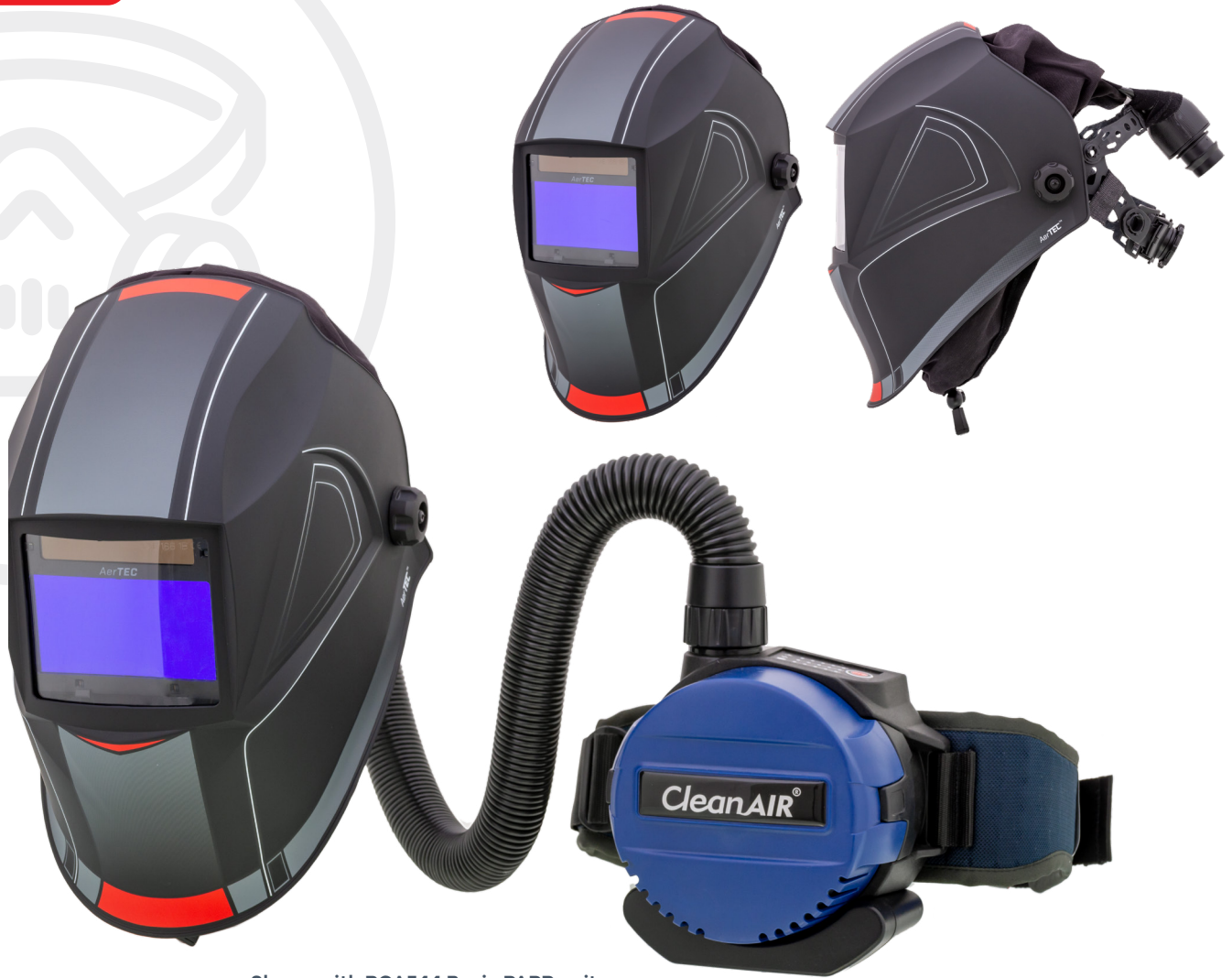
Shown with RCA544 Basic PAPP unit