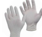
Latex Disposable Gloves - Unpowdered GLU201