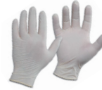
Latex Disposable Gloves - Powdered GLP200