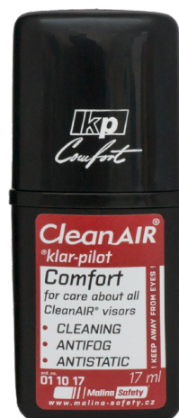
CLEANAIR KLAR-PILOT COMFORT, 17ML R11017