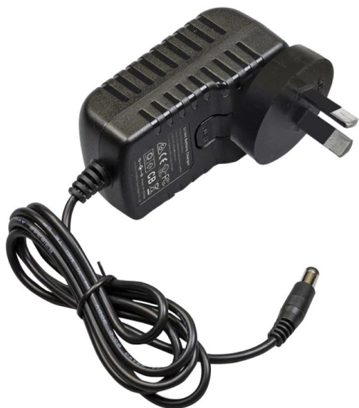
BATTERY CHARGER R710030