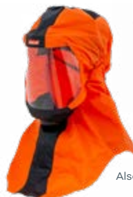
Also available in orange