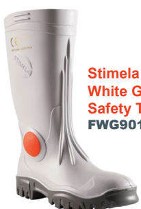
Stimela 'Executive' White Gumboot with Safety Toe FWG901