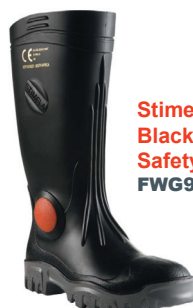
Stimela 'Foreman' Black Gumboot with Safety Toe and Midsole FWG903